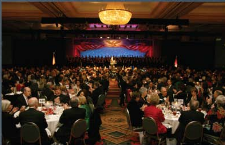
Over 1,100 individuals attended the gala event held at the Hilton Anatole Hotel in downtown Dallas on Monday, November 23.