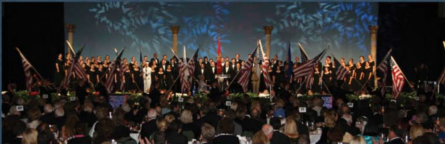
Members of the DBU chorale perform a special musical medley honoring the United States entitled "Our Flag Was Still There."