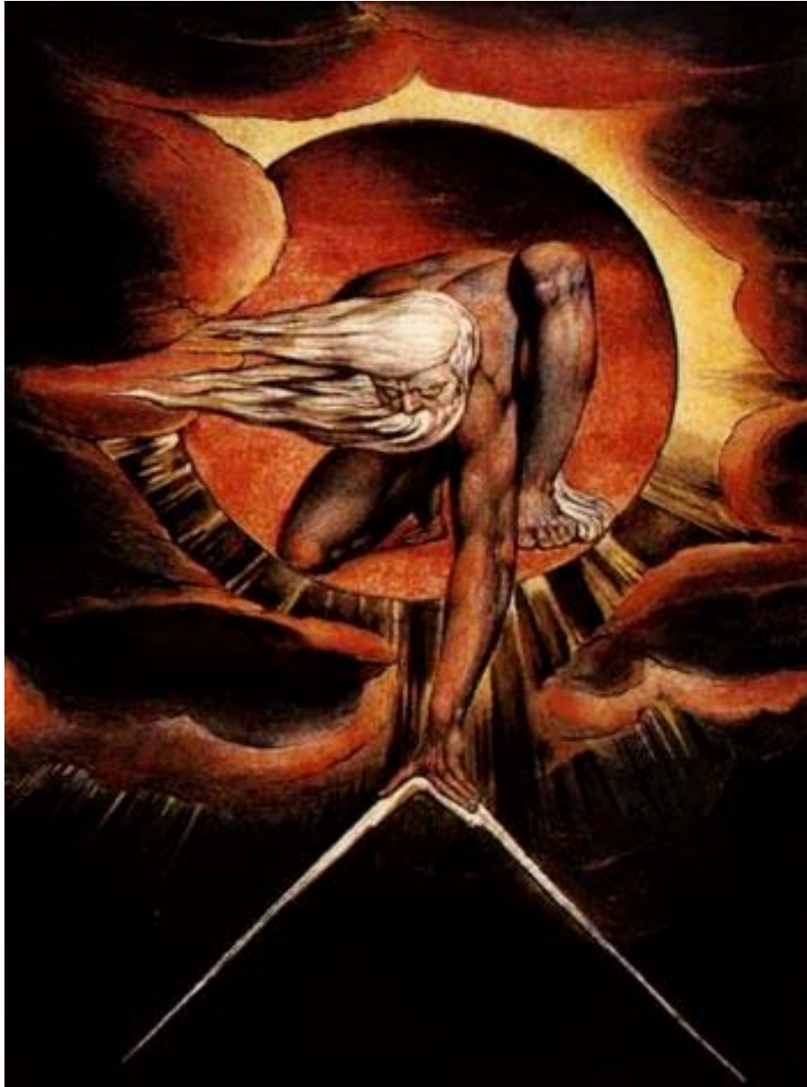
"The Ancient of Days," Wm. Blake