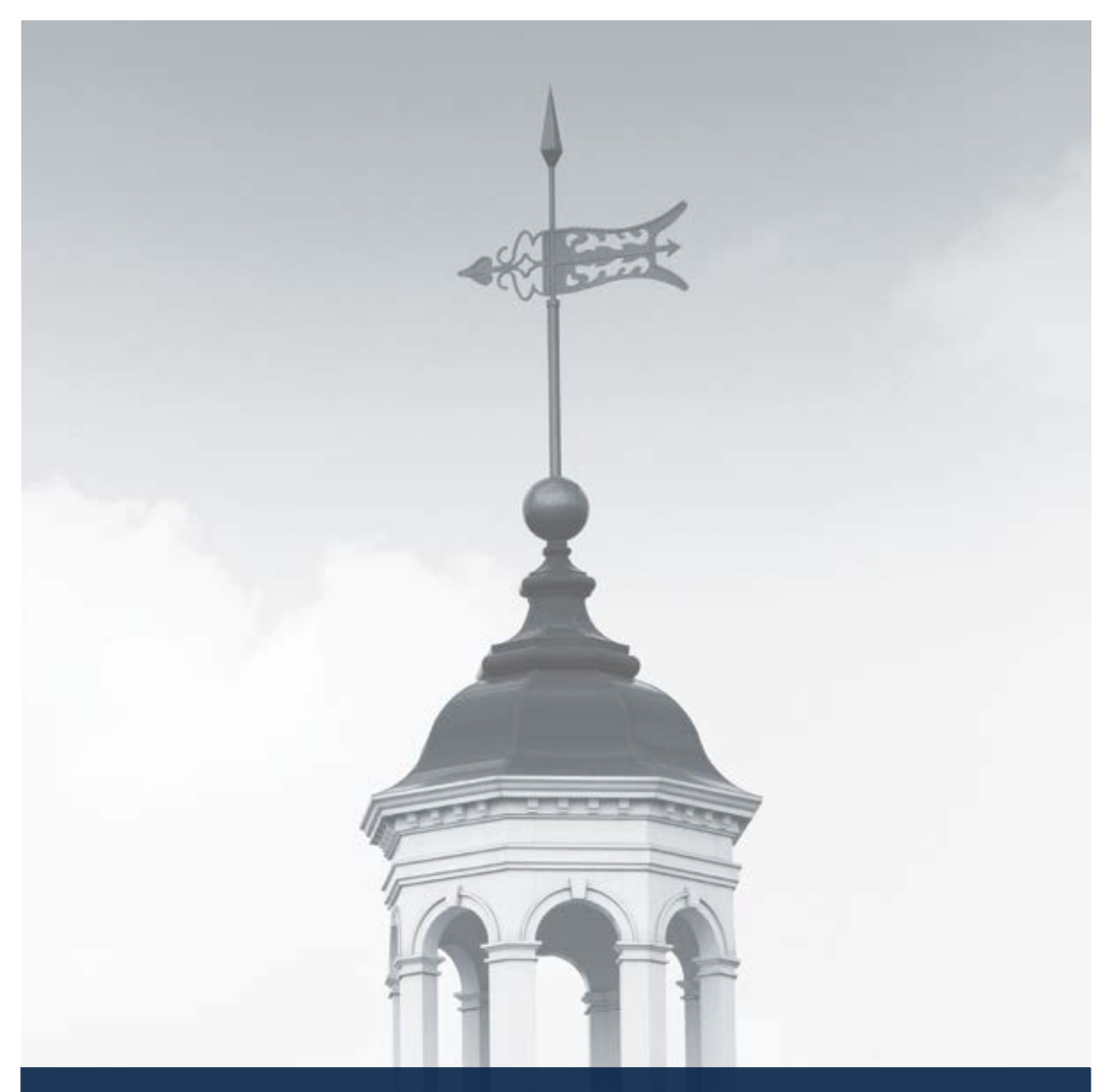
DEVELOPING SERVANT LEADERS * TRANSFORMING LIVES

"The Ph.D. in Leadership challenges students as scholars all the while cultivating their strengths as leaders and galvanizing their pursuit of God's calling."