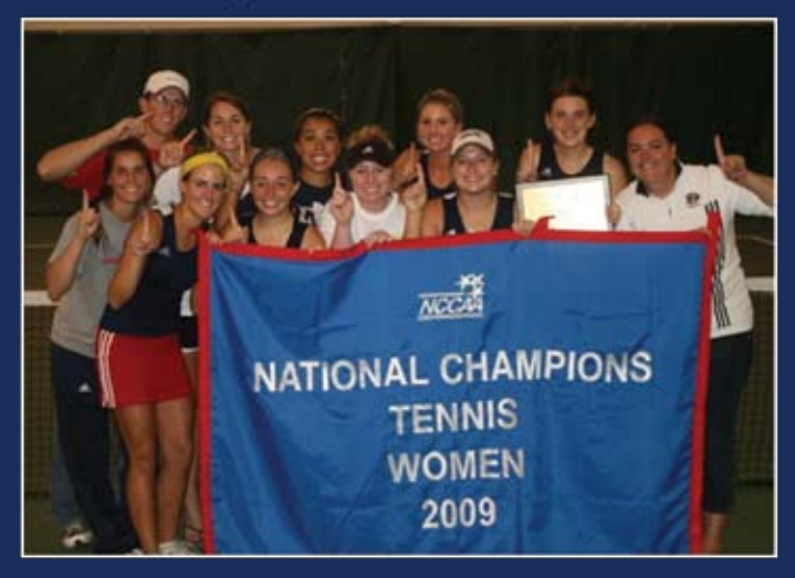
Members of the Lady Patriots Tennis Team took home the National Championship at the Spring 2009 National Christian College Athletic Association National Tournament.

The Lady Patriots made an historical march through the 2009 season, finishing as the NCCAA National Champions. The Lady Patriots were led all season by Junior