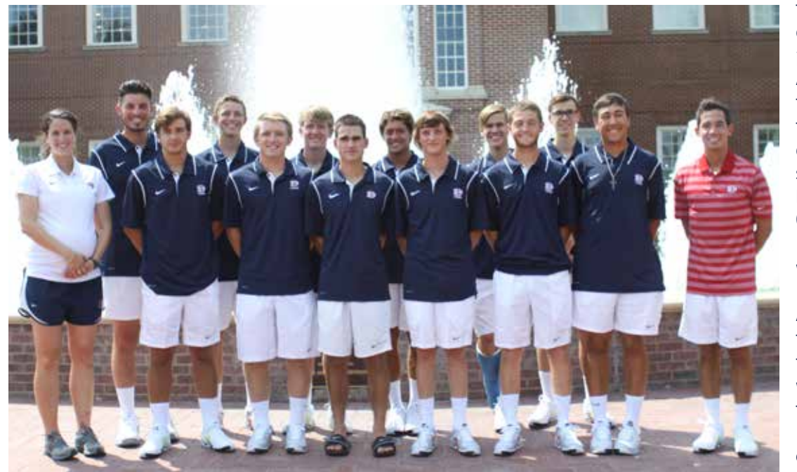
MEN'S TENNIS TEAM

Entering the Heartland Conference Tournament as the defend-