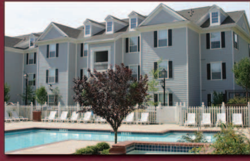
The Colonial Village Apartments were opened to students in the fall of 2002.