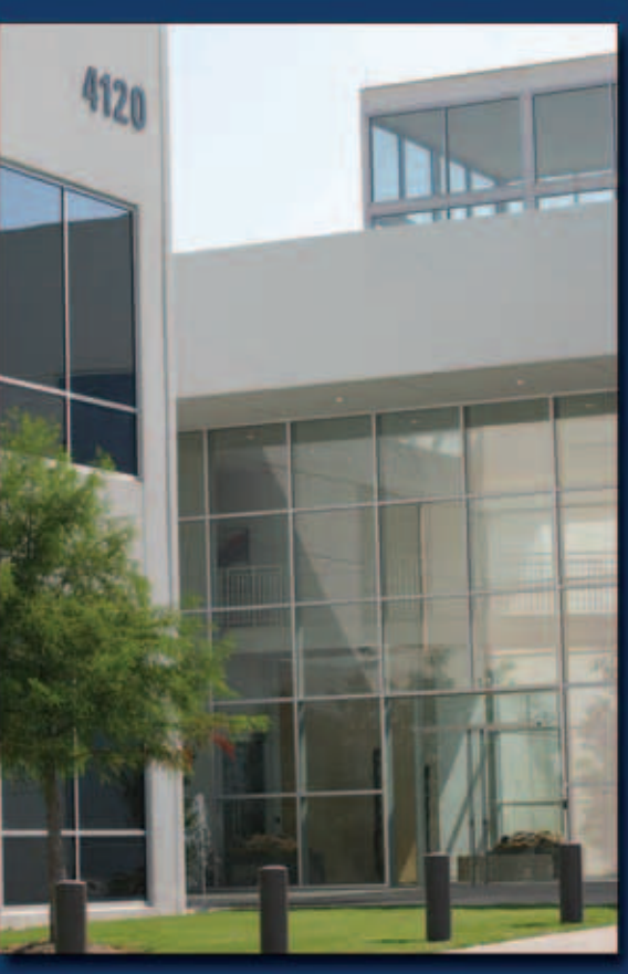
The outside of the DBU-North Dallas Center