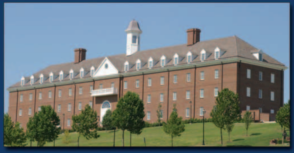
Spence Hall, modeled after the Wren Building located at the College of William and Mary, opened in 2000 and was dedicated in 2002.